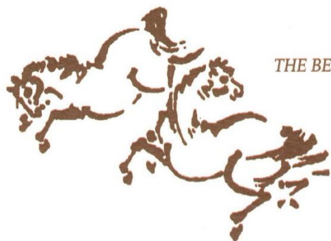
THE BETHANY HORSEMEN Bethany, Connecticut